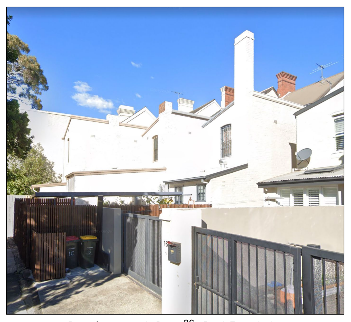
Rear of terraces 6-12 Parramatra Road, Forest Lodge