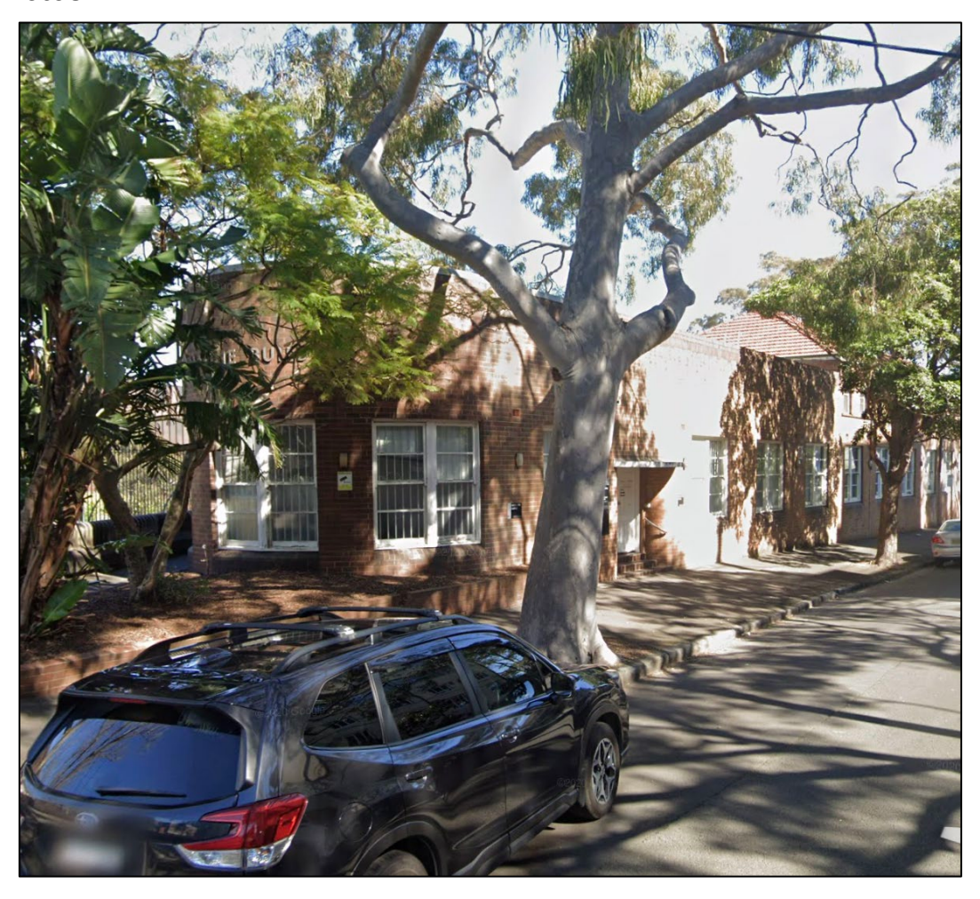
Mackie Building, 2 Arundel Street, looking west