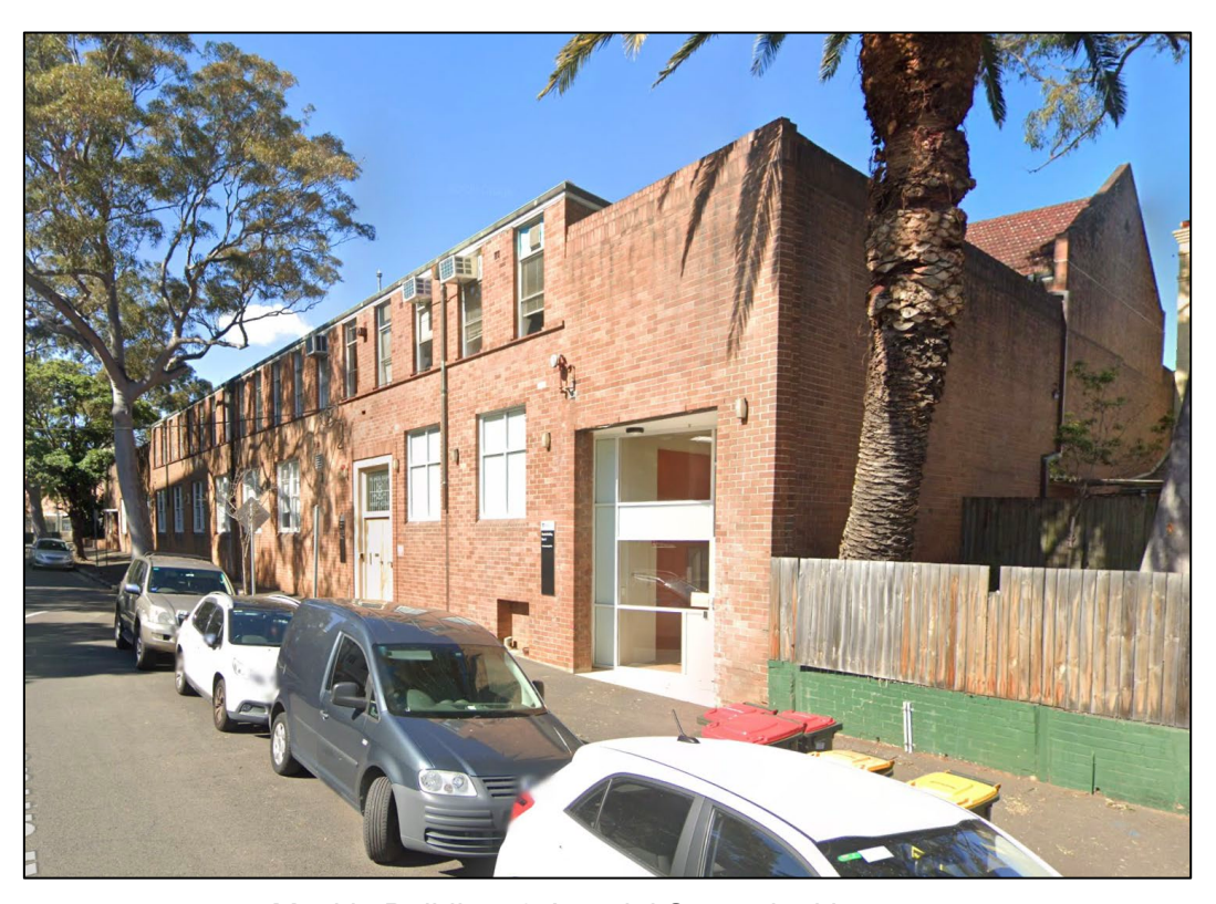
Mackie Building, 2 Arundel Street, looking east 35