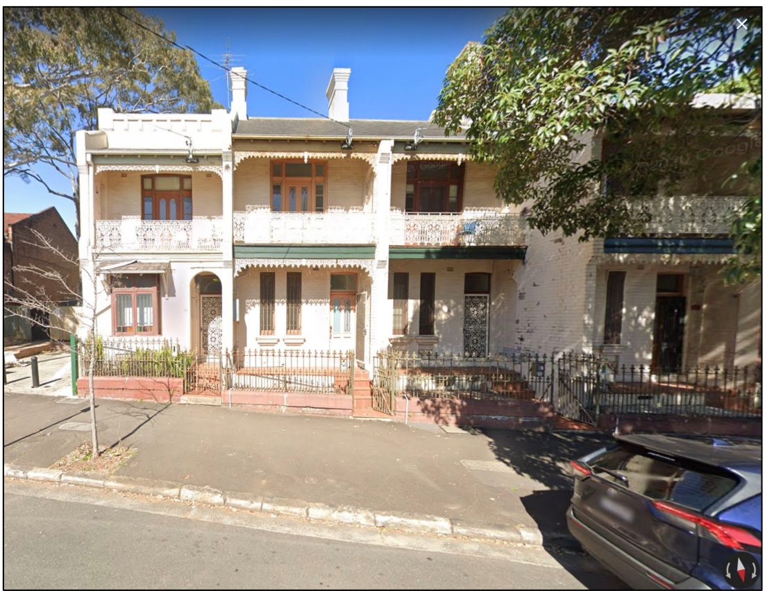
Terraces 2A, 4, 6 & 8 Arundel Street, Forest Lodge